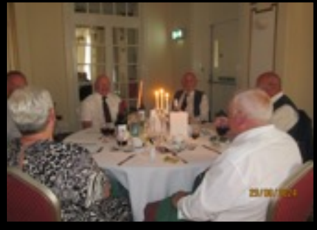
On the Saturday night members enjoying the Gala Dinner